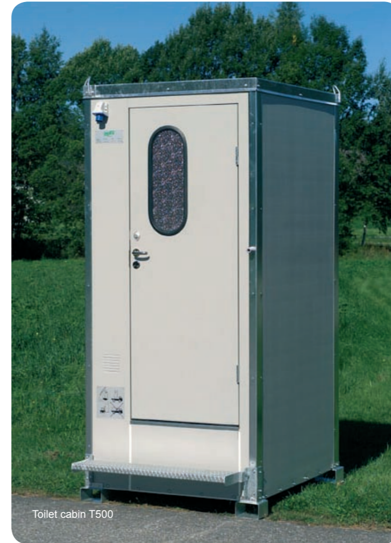
Toilet cabin T500