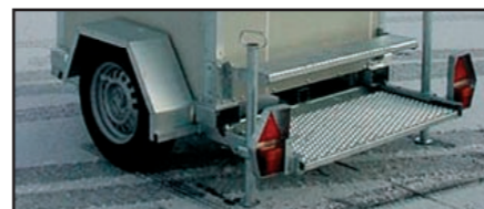
T500 with wheel chassis