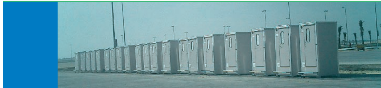
Danfo Toilet cabins at the Formula-1 race track in Bahrain.