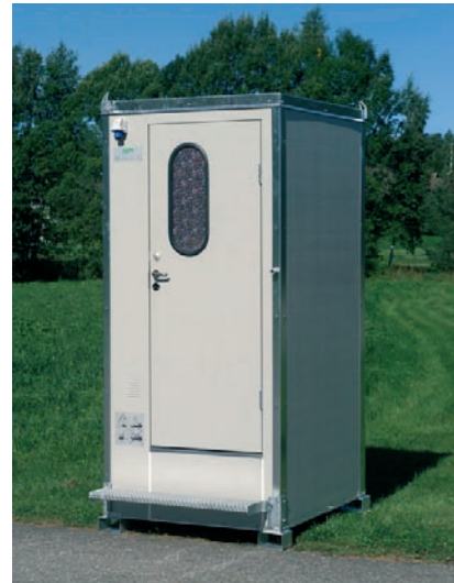
T500 Toilet cabin with a 500 litre waste tank.