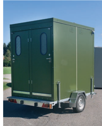
TV4 Toilet cabin with wheeled chassis and four toilet cubicles. Wheel chassis is also available for a single cabin unit.