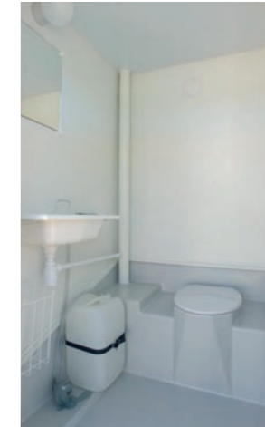
T500 with waste tank

The interior of the TV4-version is one cast piece similar to the one in the T500-version, however the cubicles are smaller and not furnished with washbasin and water container.