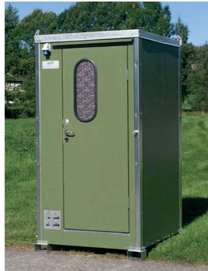
WC Toilet cabin connected to water supply and sewer system.