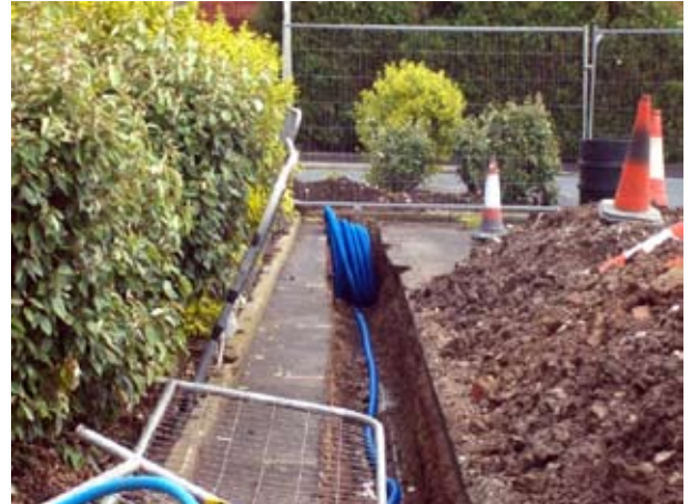
The site before work began (left), and when groundworks have started.