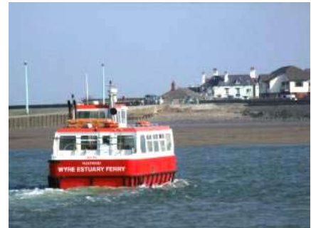
The old public toilet with bull's eye windows was very busy, but also run down (left); many visitors to the public toilet use the ferry across the Wyre Estuary between Knott End and Fleetwood (above).

To complement the surroundings, the design of the new installation incorporated a number of features. Bull's eye window details mirrored those of the old facility, Welsh arches added interest and the natural stonework cladding blended well with locally quarried slate on the roof to match a nearby building.