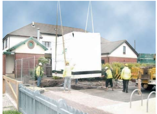
The site being prepared for the foundation (left); the public toilet installation delivered to the site for installation and cladding.