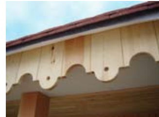
A public shelter along the banks of the River Blackwater, featuring the scalloped woodwork details that became an important part of the design for the public toilet.

Since the site was remote, access for vehicles and heavy machinery was another consideration.