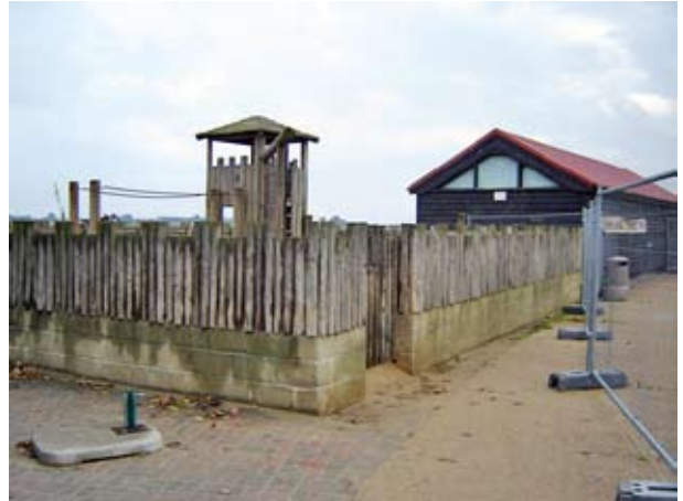
The site before work began, with the children's playground later demolished by Danfo.